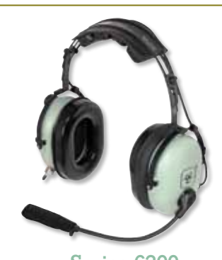
Series 6200 Radio Direct headsets connect

Find the right headset for your two-way radio at www.davidclark.com/twoway