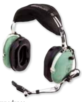
H10-76 PASSIVE NOISE ATTENUATING

David Clark Company is a trusted manufacturer of special and standard aviation headsets for the U.S. Armed Forces, NATO and most airborne command centers. All headsets are designed to withstand the rigors of the military aircraft cockpit, while providing maximum comfort, clear communications and reliable performance to ensure the safety of military aviators.