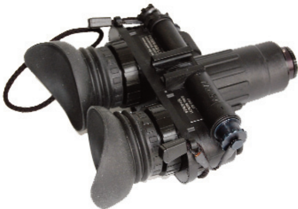
Image intensified high performance Night Vision Goggle with comprehensive range of accessories

The unit is supplied with a head mount complete with auto off/on flip up capability and is easy to use, requiring only one standard "AA" size battery. The goggle meets the night vision needs of military and law enforcement forces around the globe, utilises the very latest in tube technology and is available with a wide range of accessories.